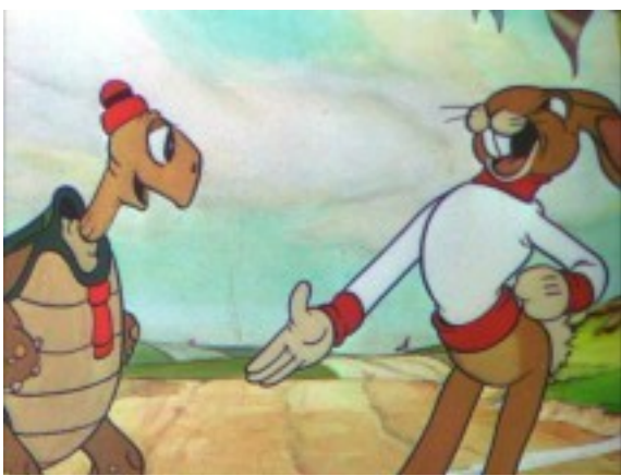
Screen shot from the film 'The Tortoise and the Hare'

After some days, the tortoise asked the hare to race once again but with a condition that the course will be chosen by him. The hare, who was confident of his victory, gave him the free hand. This time the course included a river. The hare